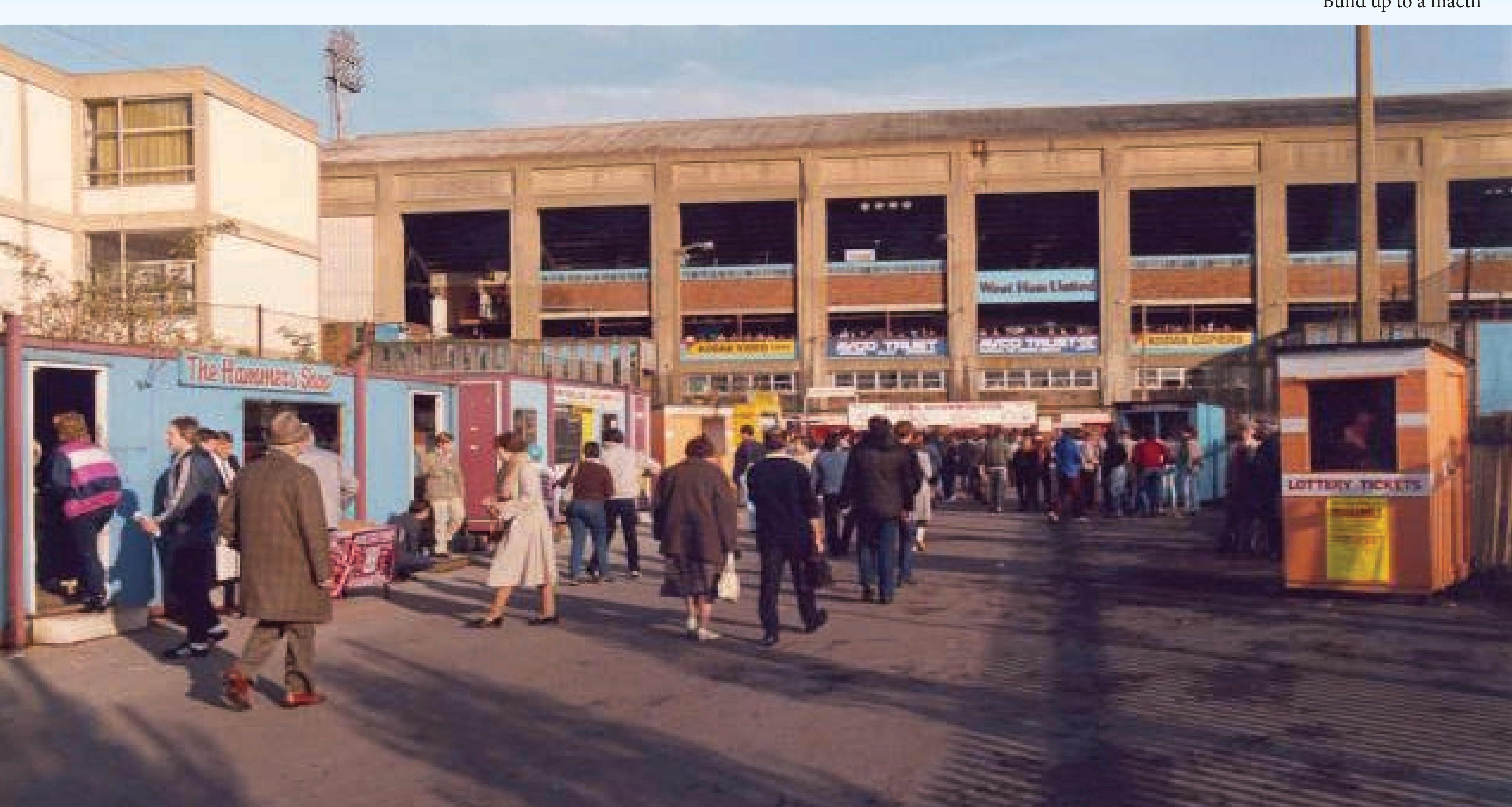
An Eastside Community Heritage exhibition. Visit our website www.hidden-histories.org.uk