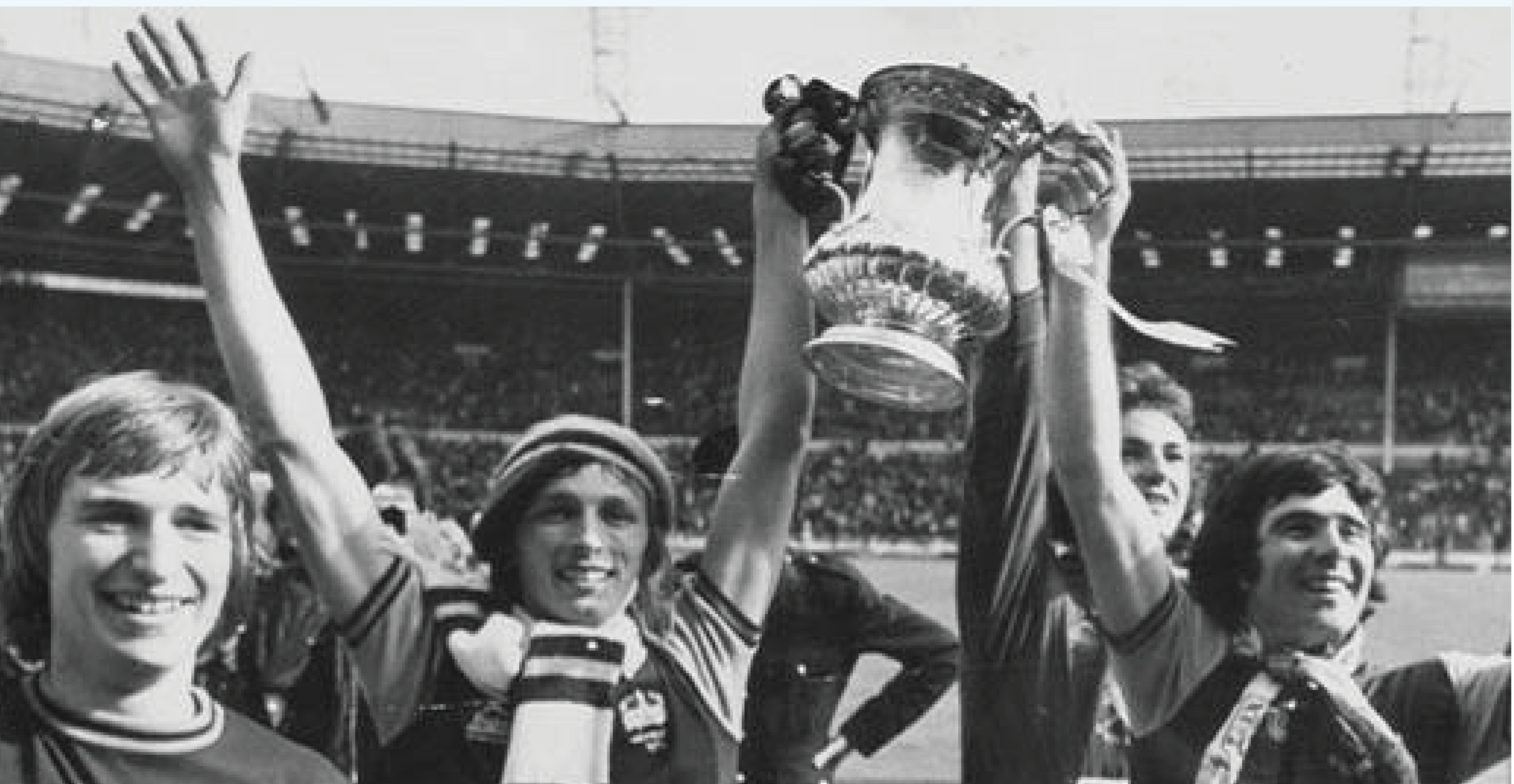
FA Cup 1975 final

An Eastside Community Heritage exhibition. Visit our website www.hidden-histories.org.uk