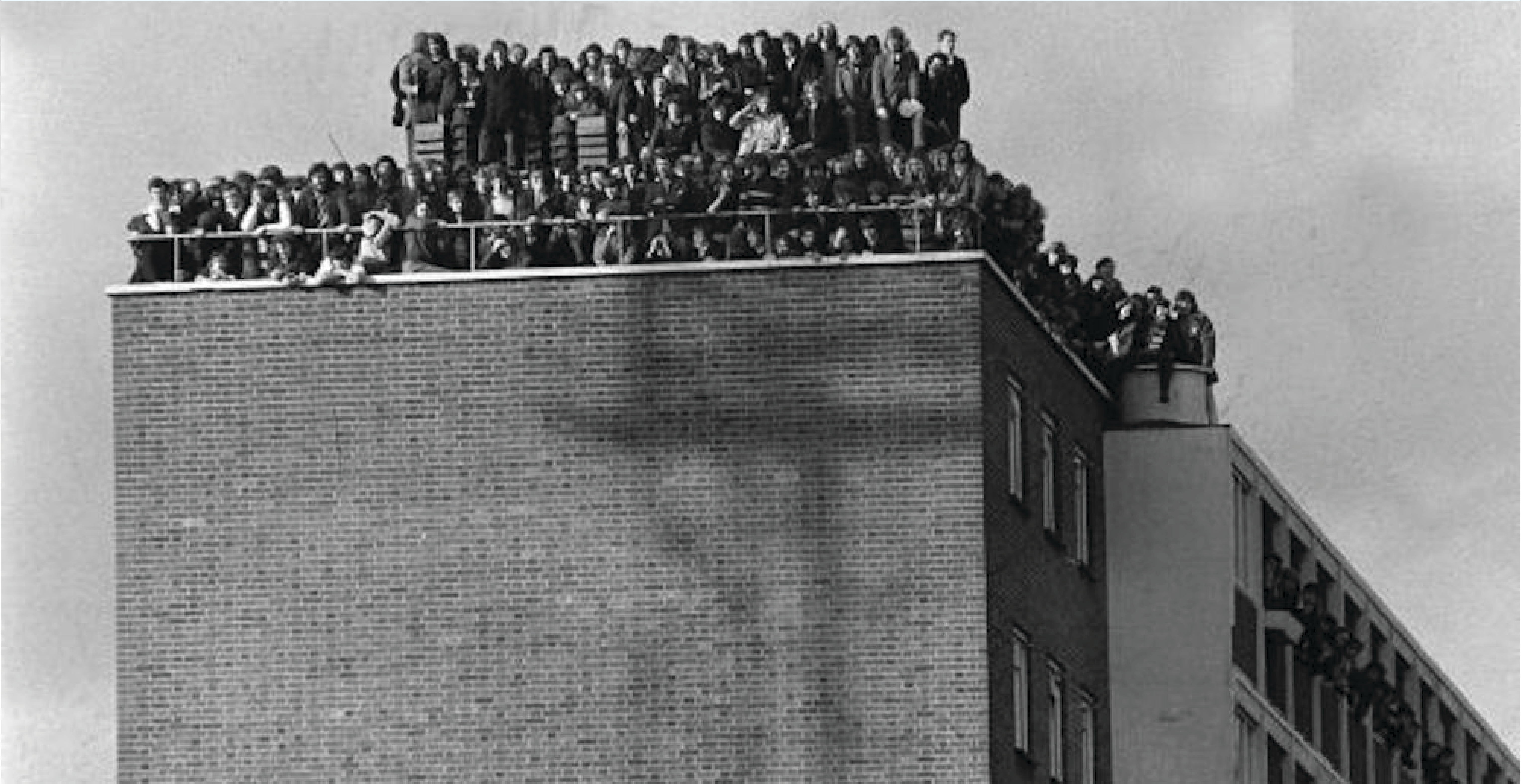
Fans watch a game from a nearby rooftop

An Eastside Community Heritage exhibition. Visit our website www.hidden-histories.org.uk