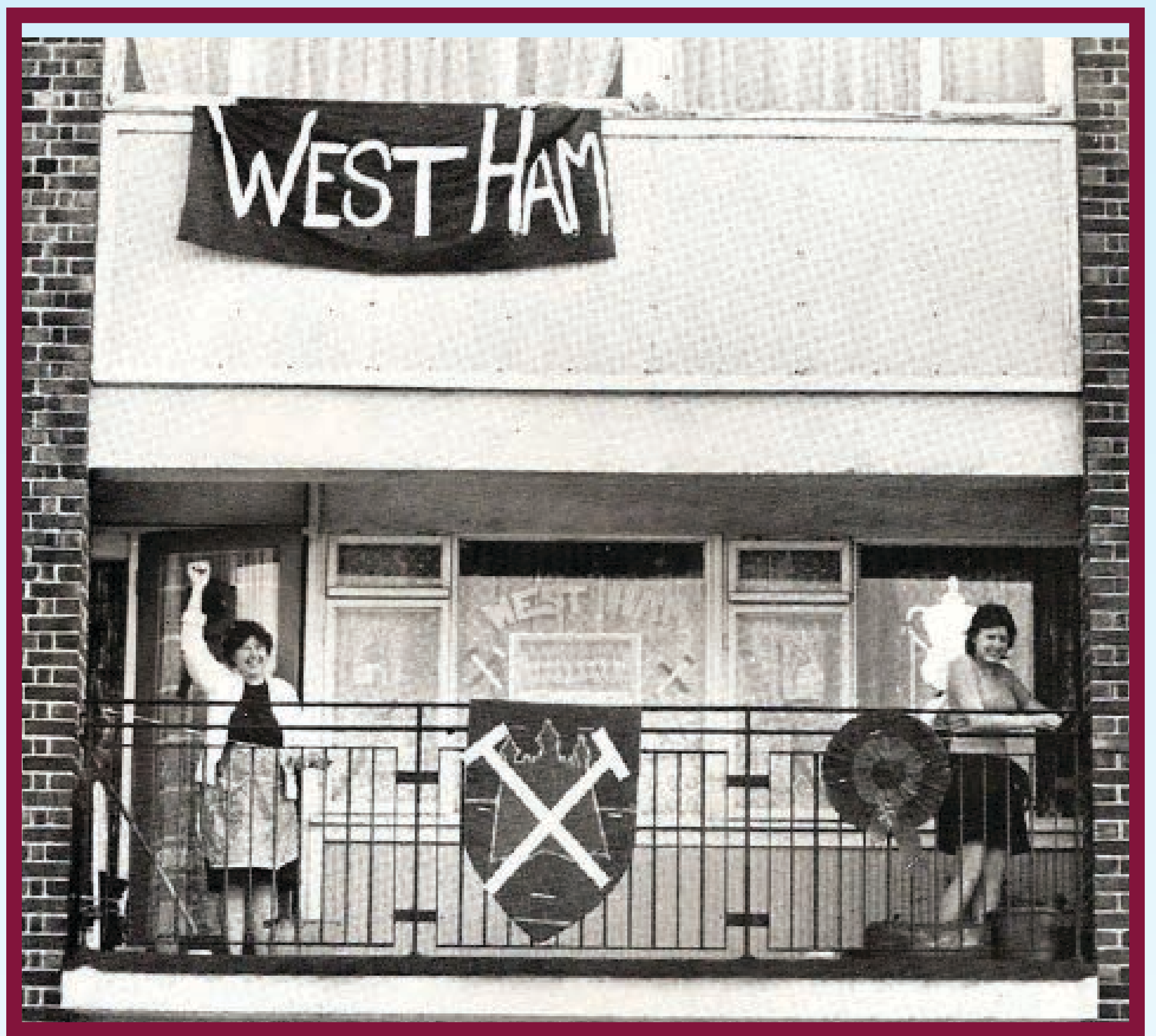
Local fans show their support