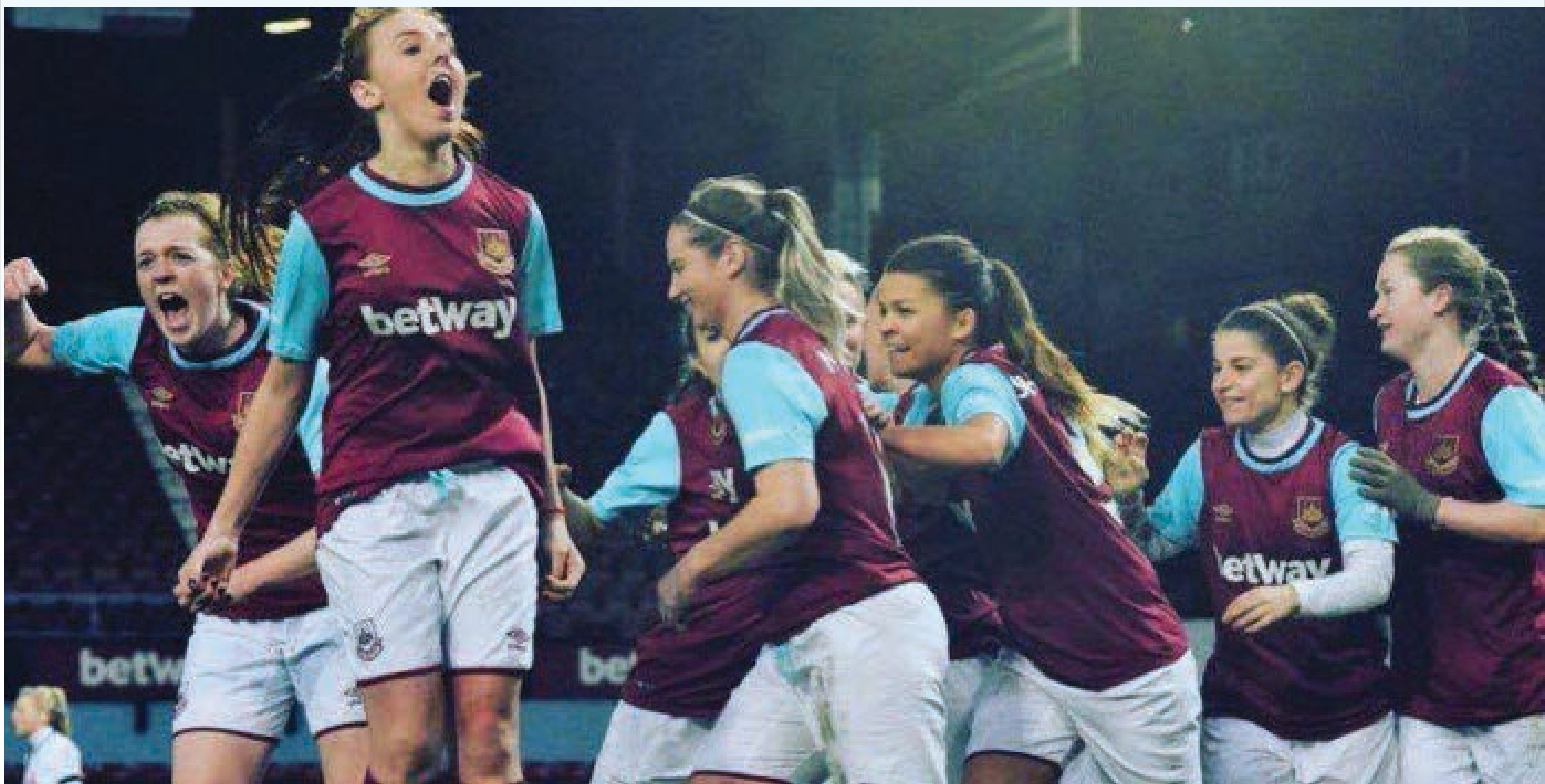
West Ham ladies team

An Eastside Community Heritage exhibition. Visit our website www.hidden-histories.org.uk