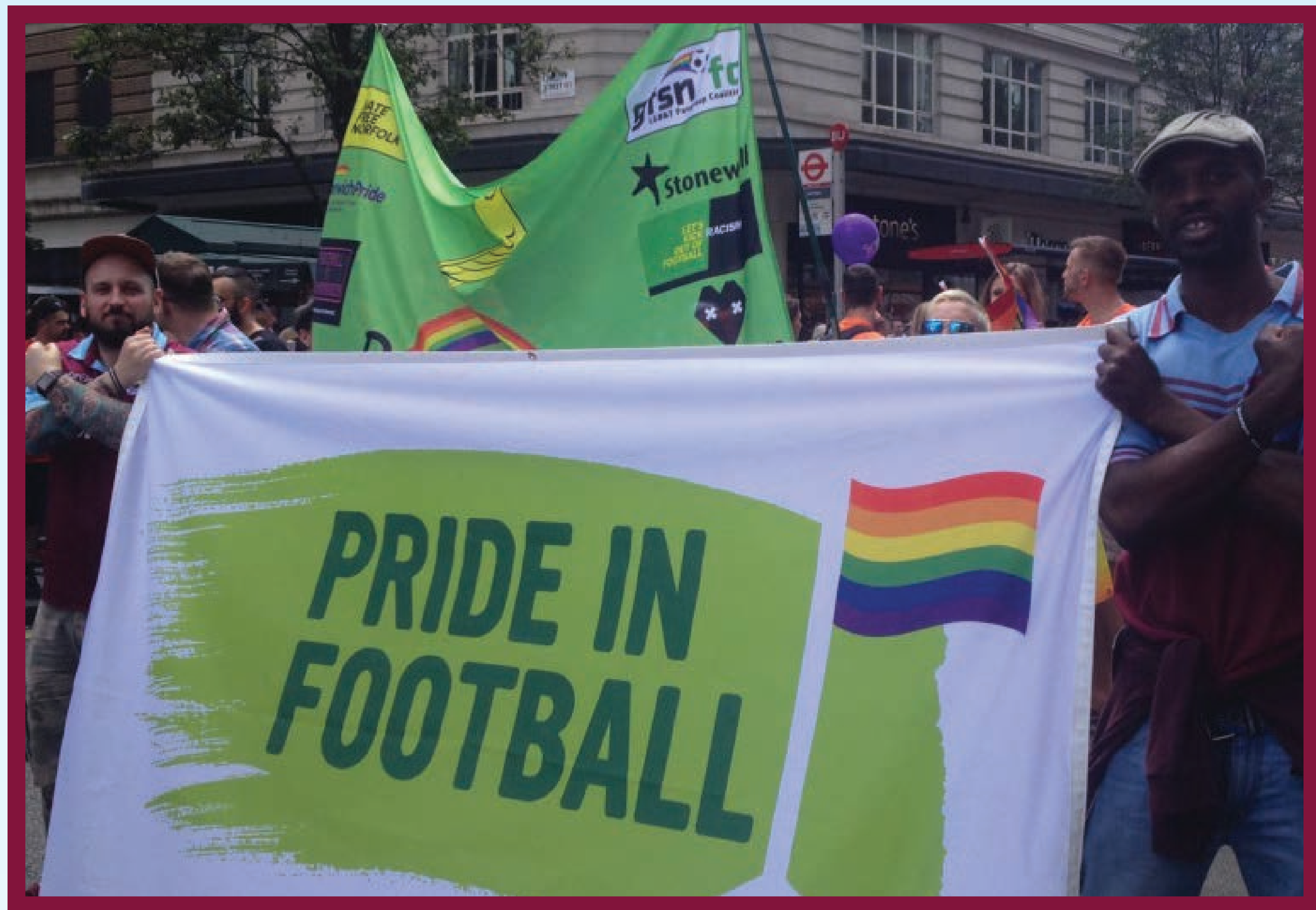
Pride of Lions marching for LGBT awareness in football