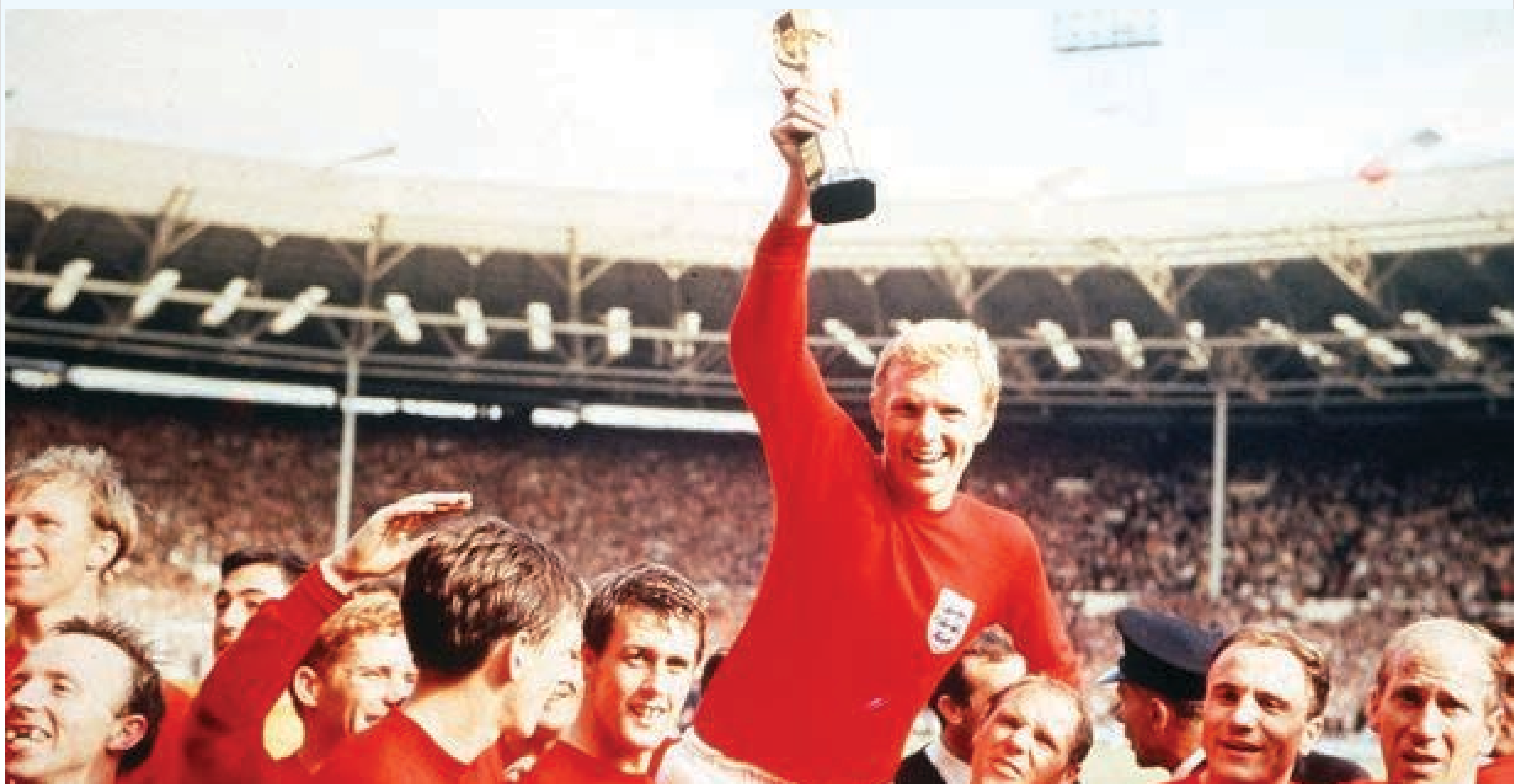
Moore raising the FIFA world cup in 1966

An Eastside Community Heritage exhibition. Visit our website www.hidden-histories.org.uk