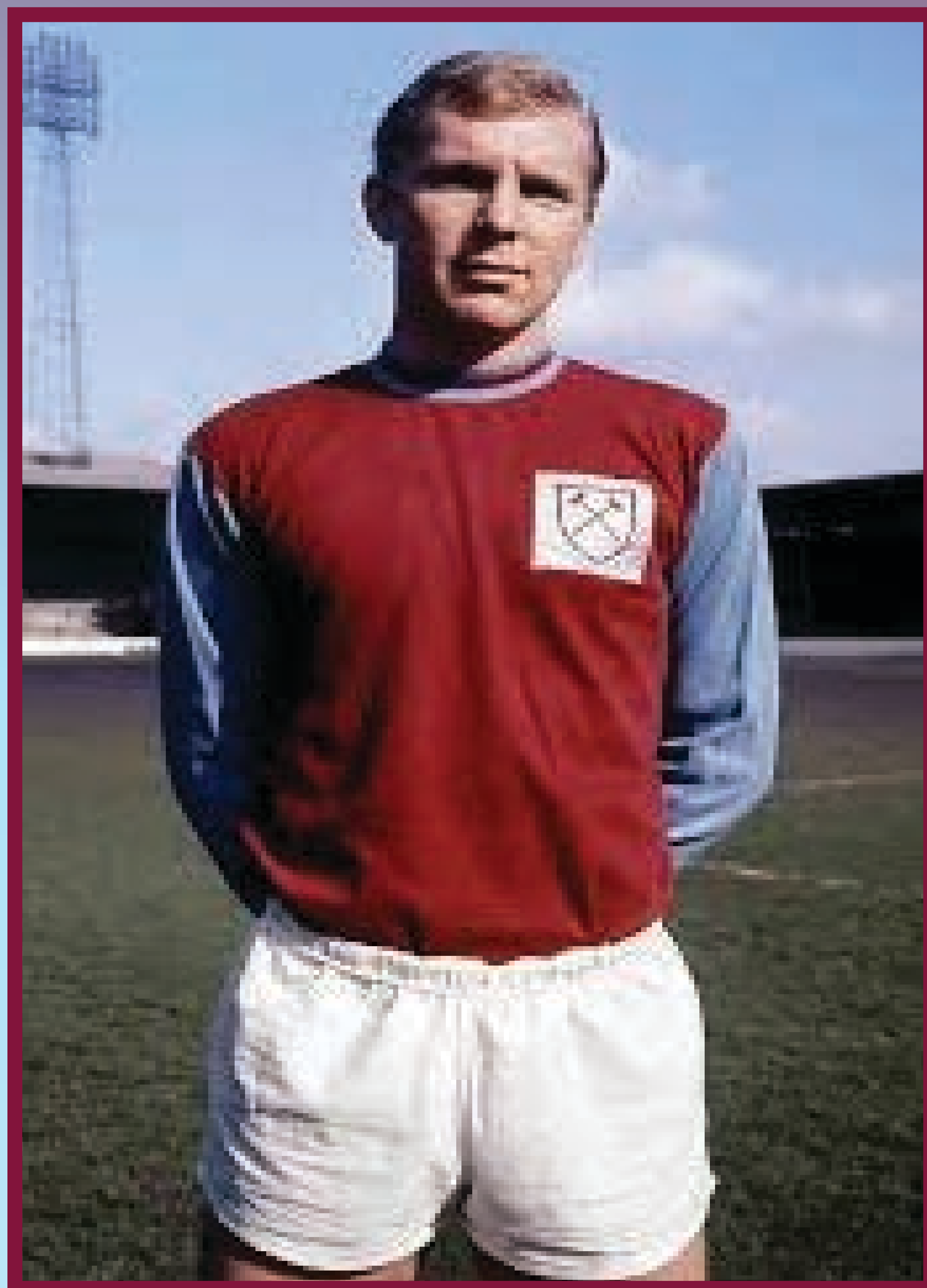
Bobby Moore played for West Ham between 1958-1974