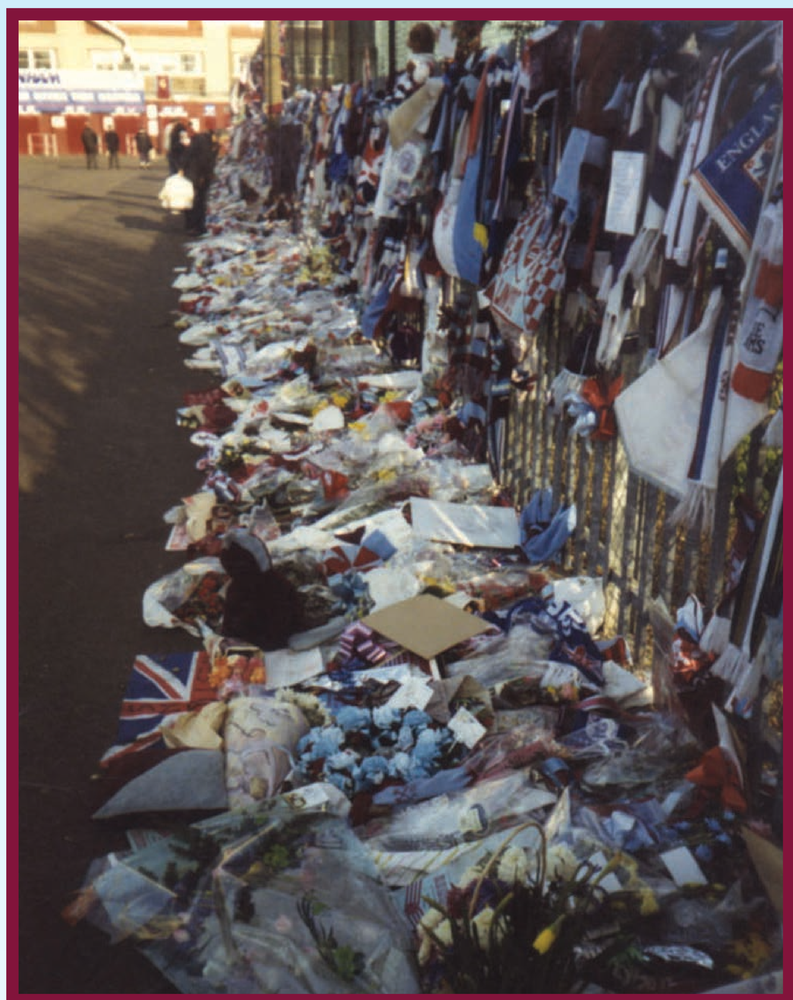
Fans pay tribute to a footballing legend