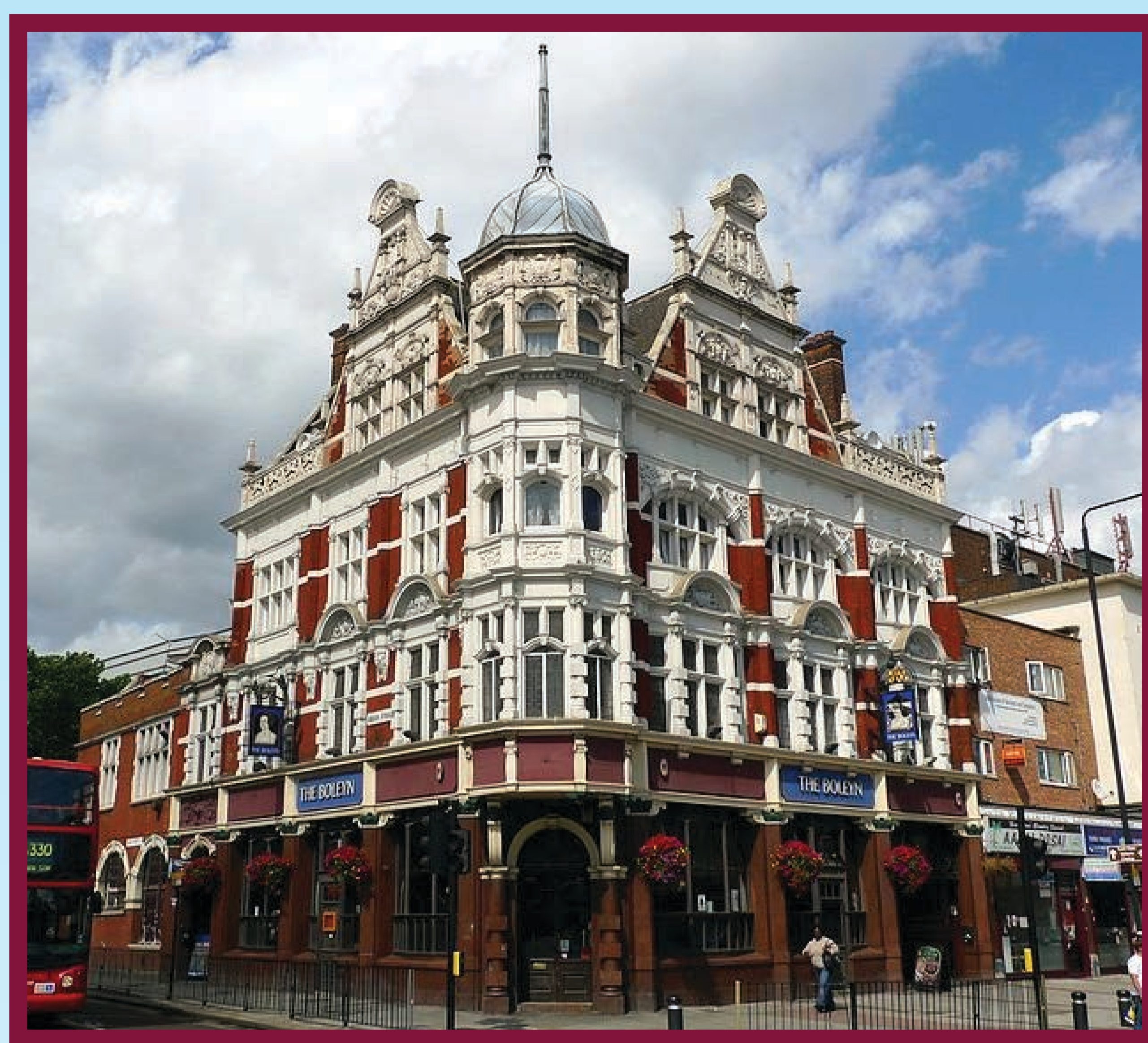
The Boleyn Pub