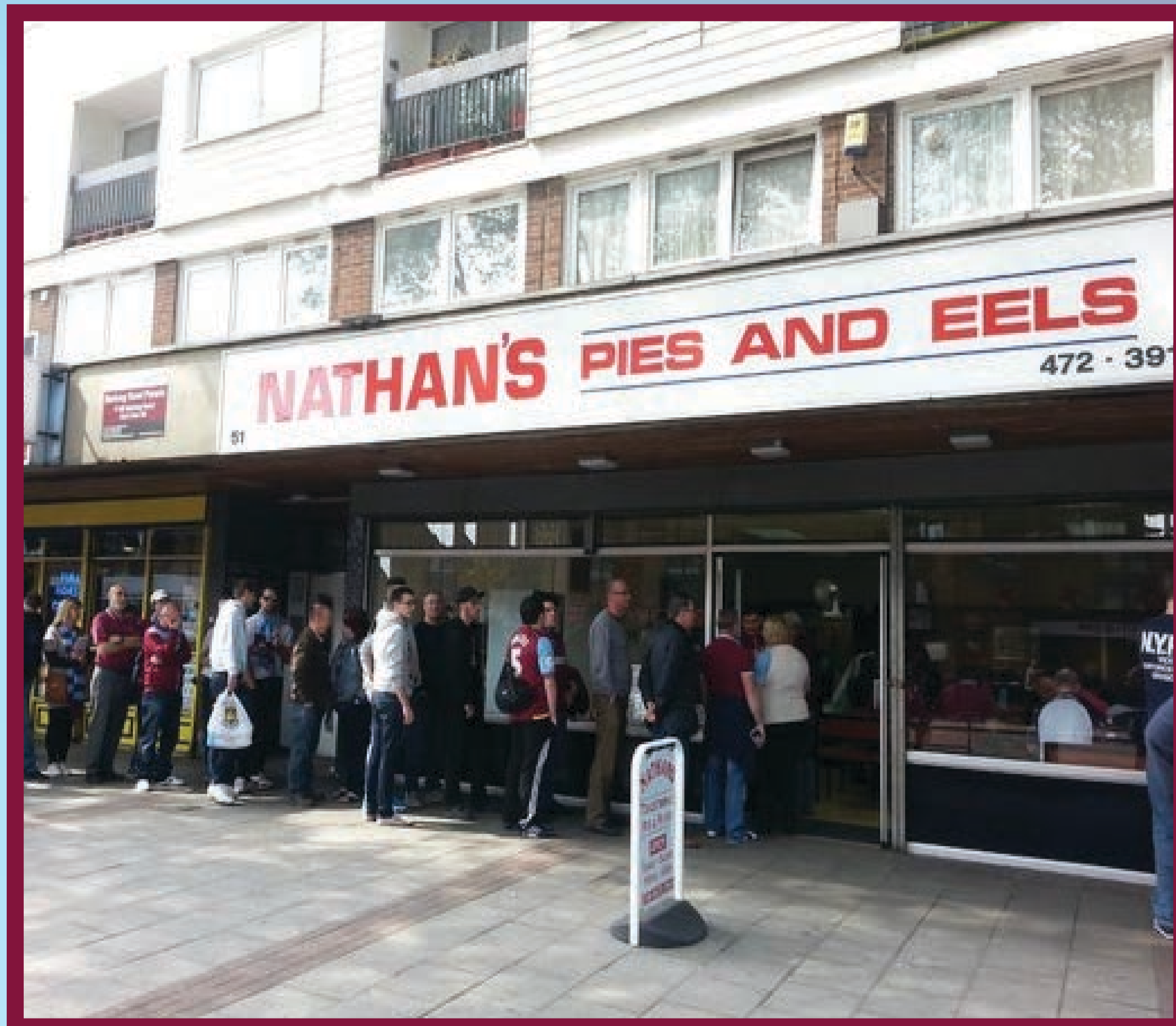
A trip to 'Nathan's' Pie and Mash shop is a match day tradition for many

The build up to home matches – the atmosphere around Barking Road and Green Street - is etched into supporters' memories: